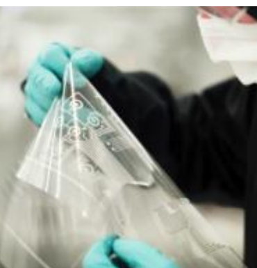
Media Coverage April to August